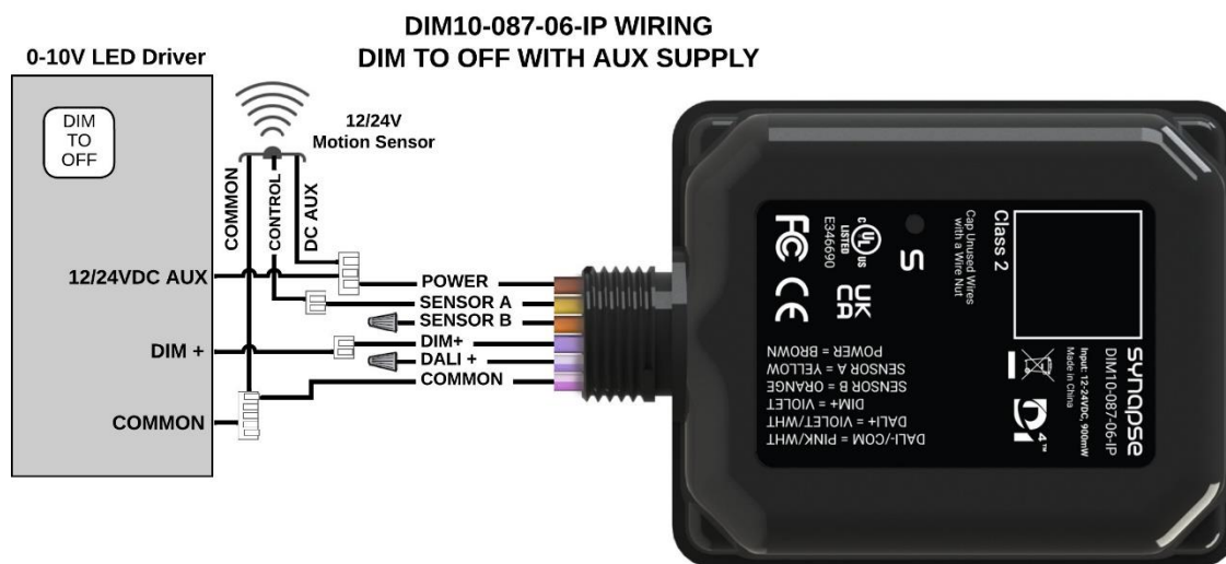
Figure 1 - DIM to OFF Wiring Diagram

For more information on SimplySnap and the DIM10-087-06-IP, refer to the website at http://help.synapsewireless.com/ .