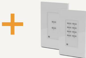
WSW-02/08 Wireless Switches