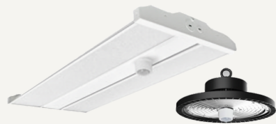
Wireless SNV-CS-10 Combo Sensor